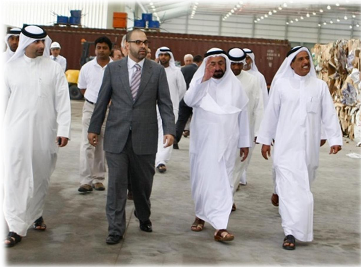
His Highness Dr. Sheikh Sultan Bin Mohammed Al Qasimi, UAE Supreme Council Member and Ruler of Sharjah, during his visit to Bee'ah's Waste Management Complex at Al Saj'ah in March, 2010.